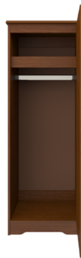
Model: LAWRO1R 25W 23.75D 71H

The Lancaster Collection offers unobtrusive refinement and skilled craftsmanship to form the perfect balance between function and beauty. Rich OG detailing on the tops and recessed insert panels set into chamfered frames on doors and drawers. Collection available with or without contrasting edges as well as custom color combinations.